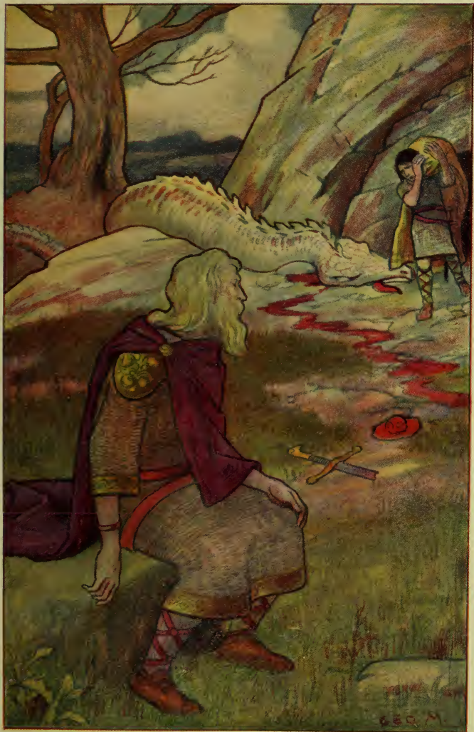
BEOWULF AND THE DRAGON.